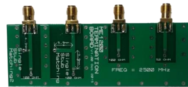
Termination board tuned at 2500MHz: